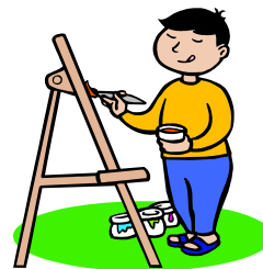
After school care is reimbursable

These funds may be used to pay for qualified dependent care expenses. The untaxed dollars you spend on dependent care may yield 40% or more in savings, depending upon your tax situation.