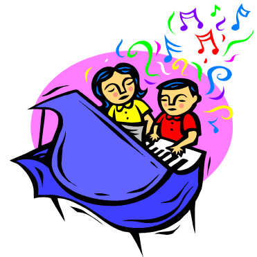
Care for a disabled adult may qualify as an eligible expense

return (or could have been claimed, except for the fact that he or she had $3,050 or more of gross income).